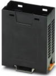
DIN rail housing, Lower housing part with base latch, tall design, with vents, width: 52.6 mm, color: black (9005)

Please be informed that the data shown in this PDF Document is generated from our Online Catalog. Please find the complete data in the user's documentation. Our General Terms of Use for Downloads are valid ( http://phoenixcontact.com/download )