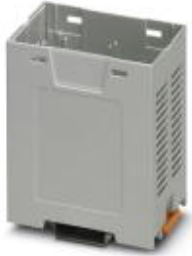
DIN rail housing, Lower housing part with base latch, tall design, with vents, width: 45.1 mm, color: light gray (7035)

Please be informed that the data shown in this PDF Document is generated from our Online Catalog. Please find the complete data in the user's documentation. Our General Terms of Use for Downloads are valid ( http://phoenixcontact.com/download )