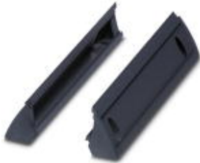
Mounting foot for panel mounting the HC-ALU panel mounting base

Please be informed that the data shown in this PDF Document is generated from our Online Catalog. Please find the complete data in the user's documentation. Our General Terms of Use for Downloads are valid ( http://phoenixcontact.com/download )