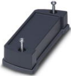
Profile housing, length: 15 mm, Side part, width: 101.9 mm, height: 36.2 mm

Please be informed that the data shown in this PDF Document is generated from our Online Catalog. Please find the complete data in the user's documentation. Our General Terms of Use for Downloads are valid ( http://phoenixcontact.com/download )