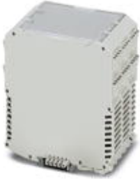
DIN rail housing, Complete housing with metal foot catch, tall design, with vents, width: 67.5 mm, color: light gray (7035)

Please be informed that the data shown in this PDF Document is generated from our Online Catalog. Please find the complete data in the user's documentation. Our General Terms of Use for Downloads are valid ( http://phoenixcontact.com/download )