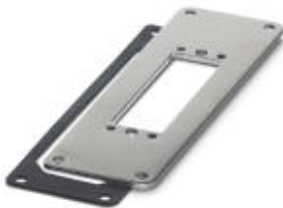
Adapter plates 2 mm thick, for panel cutouts of HC-B 24 size, including 1.5 mm flat gasket, size 4

Please be informed that the data shown in this PDF Document is generated from our Online Catalog. Please find the complete data in the user's documentation. Our General Terms of Use for Downloads are valid ( http://phoenixcontact.com/download )