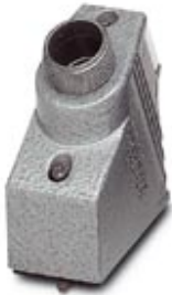
Metal sleeve housing, powder-coating, locking screws with cylindrical head, type 3, cable screw connection Pg21

Please be informed that the data shown in this PDF Document is generated from our Online Catalog. Please find the complete data in the user's documentation. Our General Terms of Use for Downloads are valid ( http://phoenixcontact.com/download )