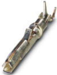
Rolled female contact, single contacts, silver-plated, 1.5 mm 2 ... 2.5 mm 2

Please be informed that the data shown in this PDF Document is generated from our Online Catalog. Please find the complete data in the user's documentation. Our General Terms of Use for Downloads are valid ( http://phoenixcontact.com/download )