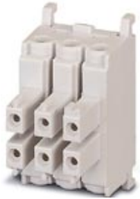
Contact insert module, for sleeve frames, with screw connection, 6-pos., 250 V / 10 A

Please be informed that the data shown in this PDF Document is generated from our Online Catalog. Please find the complete data in the user's documentation. Our General Terms of Use for Downloads are valid ( http://phoenixcontact.com/download )