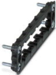
Panel mounting frame, without PE, for contact insert modules, type 4, number of insert modules 5

Please be informed that the data shown in this PDF Document is generated from our Online Catalog. Please find the complete data in the user's documentation. Our General Terms of Use for Downloads are valid ( http://phoenixcontact.com/download )