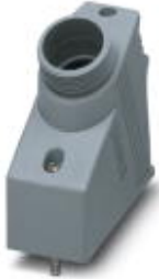
Plastic sleeve housing, locking screws with cylindrical head, type 2, cable screw connection Pg21

Please be informed that the data shown in this PDF Document is generated from our Online Catalog. Please find the complete data in the user's documentation. Our General Terms of Use for Downloads are valid ( http://phoenixcontact.com/download )