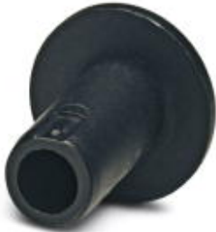
Protective cap for SUNCLIX photovoltaic connector, for IP67 protection in the cable gland.

Please be informed that the data shown in this PDF Document is generated from our Online Catalog. Please find the complete data in the user's documentation. Our General Terms of Use for Downloads are valid ( http://phoenixcontact.com/download )