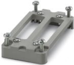
D-SUB adapter plate, for two D-SUB connectors, no. of positions 50, housing series HC-B 16...

Please be informed that the data shown in this PDF Document is generated from our Online Catalog. Please find the complete data in the user's documentation. Our General Terms of Use for Downloads are valid ( http://phoenixcontact.com/download )