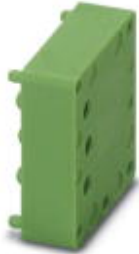
Pitch spacer, number of positions: 1, pitch: 5 mm, color: green

Please be informed that the data shown in this PDF Document is generated from our Online Catalog. Please find the complete data in the user's documentation. Our General Terms of Use for Downloads are valid ( http://phoenixcontact.com/download )