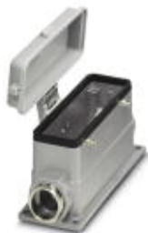
Box mounting base, for double locking latch, height 67 mm, with screw connection, 1x Pg21, with protective covers

Please be informed that the data shown in this PDF Document is generated from our Online Catalog. Please find the complete data in the user's documentation. Our General Terms of Use for Downloads are valid ( http://phoenixcontact.com/download )