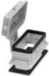
HEAVYCON B16 panel mounting base, for double locking latch, height: 29 mm, with plastic cover, with flat gasket

Please be informed that the data shown in this PDF Document is generated from our Online Catalog. Please find the complete data in the user's documentation. Our General Terms of Use for Downloads are valid ( http://phoenixcontact.com/download )