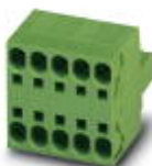
PCB connector, nominal current: 41 A, number of positions: 6, pitch: 7.62 mm, connection method: Push-in spring connection, color: green, contact surface: Tin

Printed-circuit board connector - TSPC 5/ 6-ST-7,62 - 1728497