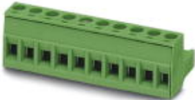
The figure shows a 10-pos. version of the product in green

PCB connector, nominal current: 12 A, number of positions: 3, pitch: 5 mm, connection method: Screw connection with tension sleeve, color: black, contact surface: Tin