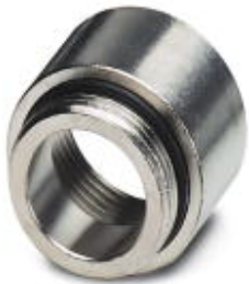
NPT adapter, IP68, up to 5 bar, incl. O-ring seal, M20 to 1/2"

Please be informed that the data shown in this PDF Document is generated from our Online Catalog. Please find the complete data in the user's documentation. Our General Terms of Use for Downloads are valid ( http://phoenixcontact.com/download )