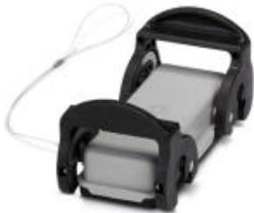
HEAVYCON protective cover, type B16, for sleeve housing without double locking latch, with retaining cord, IP54

Please be informed that the data shown in this PDF Document is generated from our Online Catalog. Please find the complete data in the user's documentation. Our General Terms of Use for Downloads are valid ( http://phoenixcontact.com/download )