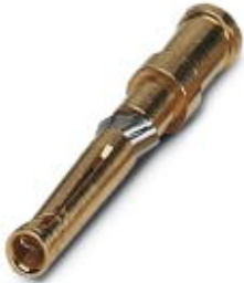
Turned 1.6 crimp contact, individual female contact, core diameter 2.5 mm 2 , gold-plated

Please be informed that the data shown in this PDF Document is generated from our Online Catalog. Please find the complete data in the user's documentation. Our General Terms of Use for Downloads are valid ( http://phoenixcontact.com/download )