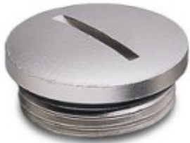
Filler plugs, for Pg screw connections, type Pg16

Please be informed that the data shown in this PDF Document is generated from our Online Catalog. Please find the complete data in the user's documentation. Our General Terms of Use for Downloads are valid ( http://phoenixcontact.com/download )