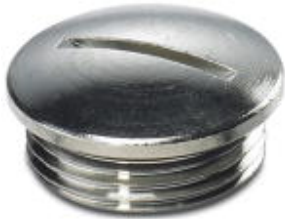
Screw plug, cable gland material: Nickel-plated brass, Brass, nickel-plated, connecting thread: Pg11, color: silver

Please be informed that the data shown in this PDF Document is generated from our Online Catalog. Please find the complete data in the user's documentation. Our General Terms of Use for Downloads are valid ( http://phoenixcontact.com/download )