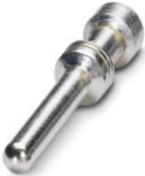
Turned 2.5 crimp contact, individual male contact, switching contact, 2 mm lagging, core diameter 1.00 mm 2 , silver-plated

Please be informed that the data shown in this PDF Document is generated from our Online Catalog. Please find the complete data in the user's documentation. Our General Terms of Use for Downloads are valid ( http://phoenixcontact.com/download )