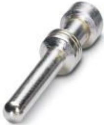
Turned 2.5 crimp contact, individual male contact, core diameter 3.00 mm 2 , silver-plated

Please be informed that the data shown in this PDF Document is generated from our Online Catalog. Please find the complete data in the user's documentation. Our General Terms of Use for Downloads are valid ( http://phoenixcontact.com/download )