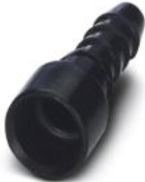
Pneumatic socket, for HC-M-PN3 module, internal hose diameter of 4.0 mm

Please be informed that the data shown in this PDF Document is generated from our Online Catalog. Please find the complete data in the user's documentation. Our General Terms of Use for Downloads are valid ( http://phoenixcontact.com/download )