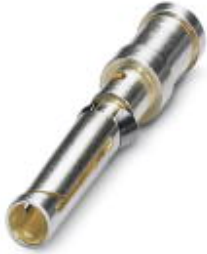
Turned 1.6 crimp contact, individual female contact, core diameter 1.5 mm 2 , silver-plated

Please be informed that the data shown in this PDF Document is generated from our Online Catalog. Please find the complete data in the user's documentation. Our General Terms of Use for Downloads are valid ( http://phoenixcontact.com/download )