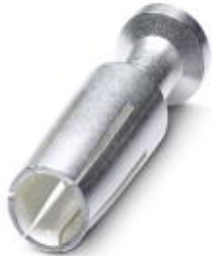
Turned 4.0 crimp contact, individual female contact, core diameter 1.50 mm 2 , silver-plated

Please be informed that the data shown in this PDF Document is generated from our Online Catalog. Please find the complete data in the user's documentation. Our General Terms of Use for Downloads are valid ( http://phoenixcontact.com/download )