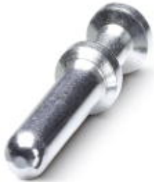
Turned 4.0 crimp contact, individual male contact, core diameter 1.5 mm 2 , silver-plated

Please be informed that the data shown in this PDF Document is generated from our Online Catalog. Please find the complete data in the user's documentation. Our General Terms of Use for Downloads are valid ( http://phoenixcontact.com/download )