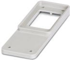
HEAVYCON adapter plate, type B24 on B6, for panel cutouts of type B24, gray

Please be informed that the data shown in this PDF Document is generated from our Online Catalog. Please find the complete data in the user's documentation. Our General Terms of Use for Downloads are valid ( http://phoenixcontact.com/download )