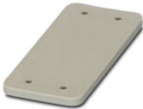
HEAVYCON cover plate, for wall cutouts of type D15, 3.5 mm thick, gray

Please be informed that the data shown in this PDF Document is generated from our Online Catalog. Please find the complete data in the user's documentation. Our General Terms of Use for Downloads are valid ( http://phoenixcontact.com/download )