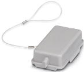
HEAVYCON protective cover, type B10, for supporting base element with single locking latch, with retaining cord, IP54, PA

Please be informed that the data shown in this PDF Document is generated from our Online Catalog. Please find the complete data in the user's documentation. Our General Terms of Use for Downloads are valid ( http://phoenixcontact.com/download )