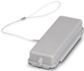
HEAVYCON protective cover, type B24, for supporting base element with single locking latch, with retaining cord, IP54, PA

Please be informed that the data shown in this PDF Document is generated from our Online Catalog. Please find the complete data in the user's documentation. Our General Terms of Use for Downloads are valid ( http://phoenixcontact.com/download )