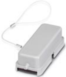
HEAVYCON protective cover, type D25, for supporting base element with single locking latch, with retaining cord, IP54, PA

Please be informed that the data shown in this PDF Document is generated from our Online Catalog. Please find the complete data in the user's documentation. Our General Terms of Use for Downloads are valid ( http://phoenixcontact.com/download )