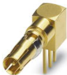
Coaxial contact, for D-SUB combination inserts, for PCB assembly, pin, angled, gold-plated

Please be informed that the data shown in this PDF Document is generated from our Online Catalog. Please find the complete data in the user's documentation. Our General Terms of Use for Downloads are valid ( http://phoenixcontact.com/download )