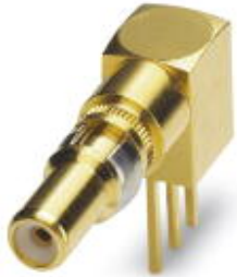
Coaxial contact, for D-SUB combination inserts, for PCB assembly, socket, angled, gold-plated

Please be informed that the data shown in this PDF Document is generated from our Online Catalog. Please find the complete data in the user's documentation. Our General Terms of Use for Downloads are valid ( http://phoenixcontact.com/download )