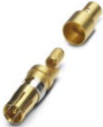
Coaxial contact, for D-SUB combination inserts, solder cup, pin, straight, for cable RG 174, gold-plated

Please be informed that the data shown in this PDF Document is generated from our Online Catalog. Please find the complete data in the user's documentation. Our General Terms of Use for Downloads are valid ( http://phoenixcontact.com/download )