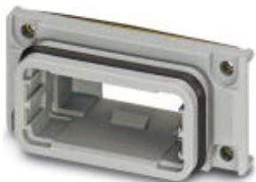
D-SUB panel mounting frame, shell size 1, IP67 degree of protection

Please be informed that the data shown in this PDF Document is generated from our Online Catalog. Please find the complete data in the user's documentation. Our General Terms of Use for Downloads are valid ( http://phoenixcontact.com/download )