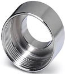
Step-up adapter, M16 to M20, including O-ring

Please be informed that the data shown in this PDF Document is generated from our Online Catalog. Please find the complete data in the user's documentation. Our General Terms of Use for Downloads are valid ( http://phoenixcontact.com/download )