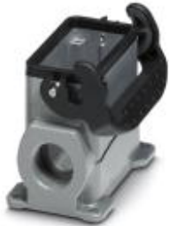
HEAVYCON box mounting base B10, with single locking latch, height 74 mm, with support 1xM25

Please be informed that the data shown in this PDF Document is generated from our Online Catalog. Please find the complete data in the user's documentation. Our General Terms of Use for Downloads are valid ( http://phoenixcontact.com/download )