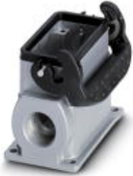
HEAVYCON box mounting base B10, with single locking latch, height 52 mm, with support 2xM20

Please be informed that the data shown in this PDF Document is generated from our Online Catalog. Please find the complete data in the user's documentation. Our General Terms of Use for Downloads are valid ( http://phoenixcontact.com/download )