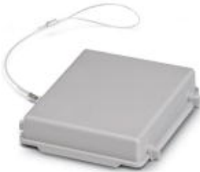
HEAVYCON protective cover, type B32, for supporting base element with double locking latch, with retaining cord, IP54, PA

Please be informed that the data shown in this PDF Document is generated from our Online Catalog. Please find the complete data in the user's documentation. Our General Terms of Use for Downloads are valid ( http://phoenixcontact.com/download )