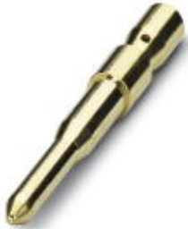
Crimp contact, turned, Contact diameter: 1.5 mm, Crimp range: 0.5 mm 2 ...1 mm 2

Please be informed that the data shown in this PDF Document is generated from our Online Catalog. Please find the complete data in the user's documentation. Our General Terms of Use for Downloads are valid ( http://phoenixcontact.com/download )