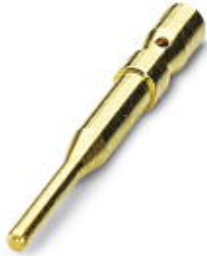
Crimp contact, turned, Contact diameter: 1 mm, Crimp range: 0.5 mm 2 ...1 mm 2

Please be informed that the data shown in this PDF Document is generated from our Online Catalog. Please find the complete data in the user's documentation. Our General Terms of Use for Downloads are valid ( http://phoenixcontact.com/download )