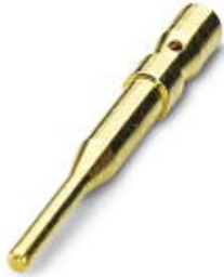
Crimp contact, turned, Contact diameter: 1 mm, Crimp range: 0.08 mm 2 ...0.22 mm 2

Please be informed that the data shown in this PDF Document is generated from our Online Catalog. Please find the complete data in the user's documentation. Our General Terms of Use for Downloads are valid ( http://phoenixcontact.com/download )