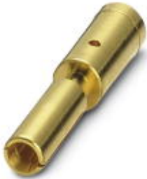
Crimp contact, turned, Contact diameter: 1 mm, Crimp range: 1 mm 2 ...1.5 mm 2

Please be informed that the data shown in this PDF Document is generated from our Online Catalog. Please find the complete data in the user's documentation. Our General Terms of Use for Downloads are valid ( http://phoenixcontact.com/download )