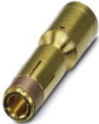
Crimp contact, turned, Single contact, Contact diameter: 3.6 mm, Crimp range: 4 mm 2 ...6 mm 2

Please be informed that the data shown in this PDF Document is generated from our Online Catalog. Please find the complete data in the user's documentation. Our General Terms of Use for Downloads are valid ( http://phoenixcontact.com/download )