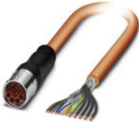
Cable plug in molded plastic, Length: 2 m, Color of outer sheath: orange RAL 2003

Please be informed that the data shown in this PDF Document is generated from our Online Catalog. Please find the complete data in the user's documentation. Our General Terms of Use for Downloads are valid ( http://phoenixcontact.com/download )