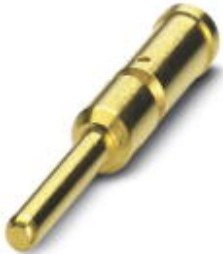
Crimp contact, turned, contact diameter: 2 mm, crimp range: 0.25 mm 2 ... 1 mm 2

Please be informed that the data shown in this PDF Document is generated from our Online Catalog. Please find the complete data in the user's documentation. Our General Terms of Use for Downloads are valid ( http://phoenixcontact.com/download )