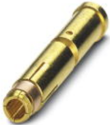
Crimp contact, turned, contact diameter: 2 mm, crimp range: 1.5 mm 2 ... 2.5 mm 2

Please be informed that the data shown in this PDF Document is generated from our Online Catalog. Please find the complete data in the user's documentation. Our General Terms of Use for Downloads are valid ( http://phoenixcontact.com/download )